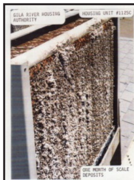
ONE MONTH OF SCALE DEPOSITS