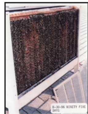
NINETY-FIVE DAYS AFTER INSTALL