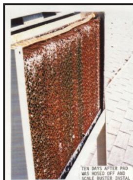
TEN DAYS AFTER PAD WAS HOSED OFF AND SCALEBLASTER INSTALL