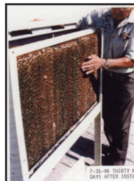
THIRTY-NINE DAYS AFTER INSTALL