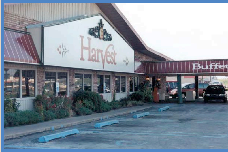
Harvest Buffet Restaurant, Tulsa, Oklahoma

The owners, Phil and Jill Dietz, are saving thousands of dollars annually on maintenance cost due to scale deposits. The two main boilers literally "cleaned" themselves from calcium buildup to everyone's amazement (see referral letter on backside). The owners are pleased that their water is acting like its soft water without having to use a water softener - which requires a lot of salt and maintenance.