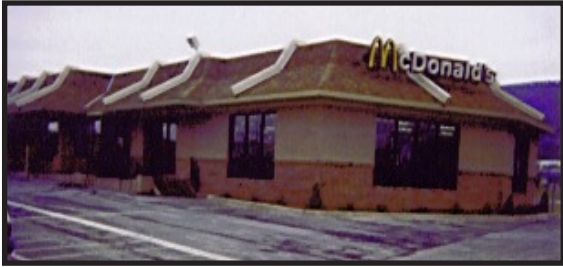
McDonald's® Restaurant State College, PA