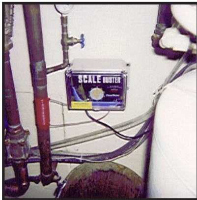
ScaleBlaster™ installed at the McDonald's® location pictured above.