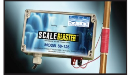
ClearWater Enviro Tech's electronic descaler, the ScaleBlaster™.

They were approached by a ClearWater dealer who offered a solution to their problems - the ScaleBlaster™. The concept of a low cost device that required no chemicals, salts or maintenance was intriguing to the owners.